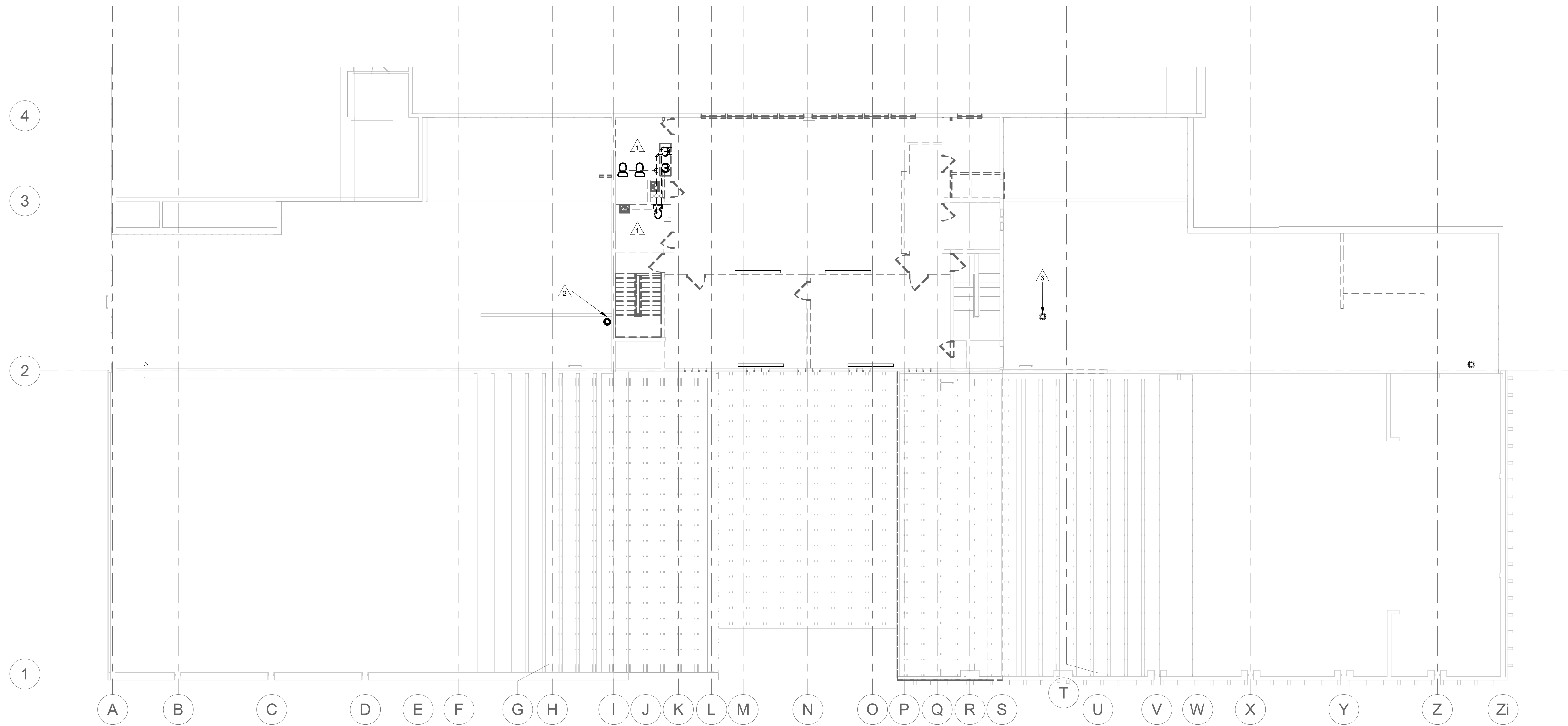
LEVEL 2 - PLUMBING DEMOLITION 1 3/32" = 1'-0" MP2.2